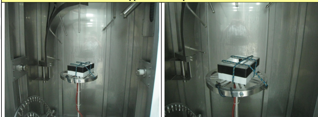
2. Waterproof test